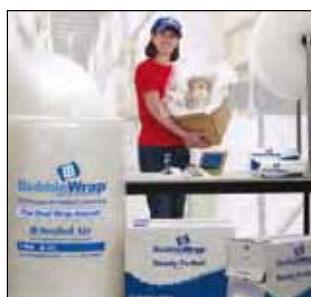
BubbleWrap® Brand Protective Shipping Products

Sealed Air's industry-leading investment in research and development and constant focus on World Class Manufacturing principles allow us to continually deliver innovative packaging solutions that add measurable value to our customers' businesses around the world.