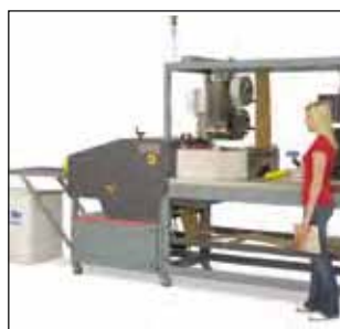
Priority Pak® Automated Packaging Systems