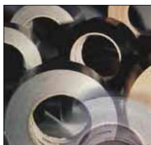
Danco Tapes® Specialty Adhesive Tapes