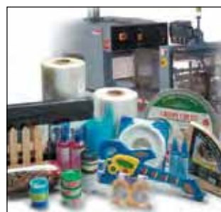
Cryovac® Performance Shrink Films