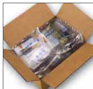
Fill-Air® Inflatable Packaging Systems