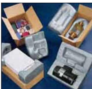
Instapak® Foam Packaging