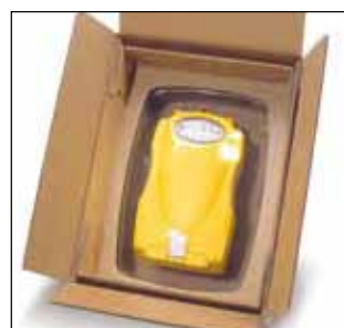
Korrvu® Suspension Packaging