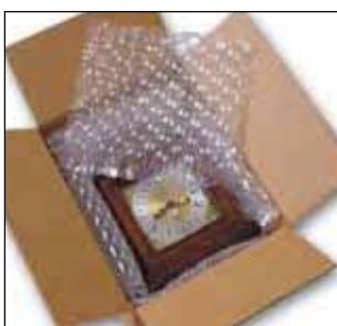
NewAir I.B.™ Packaging Systems